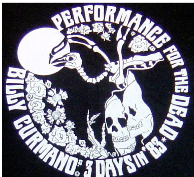
Performance for the Dead original logo – (Billy X design)

After a 4-day fast, Italian Wake and Jazz Funeral, Billy was buried alive for 3-days in the 1983 Performance for the Dead . His fast continued in the absolute darkness of the burial vault. Artists from over 25 countries responded to the performance, immortality and death with postal art for the parallel exhibition, In Sympathy .